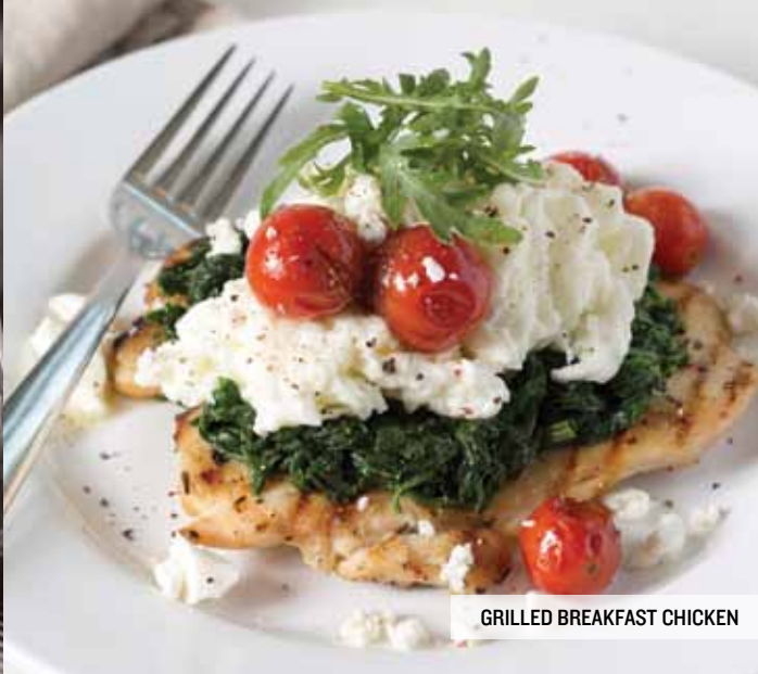
GRILLED BREAKFAST CHICKEN