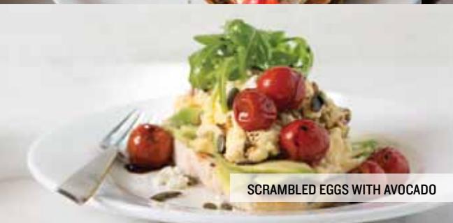
SCRAMBLED EGGS WITH AVOCADO