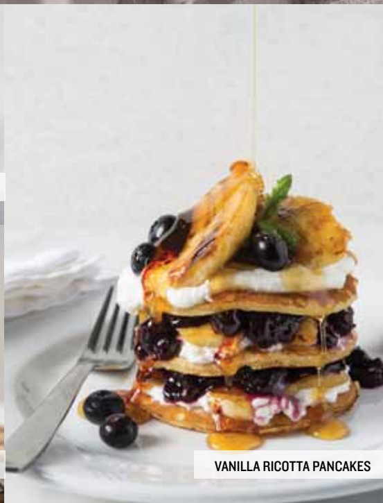
VANILLA RICOTTA PANCAKES