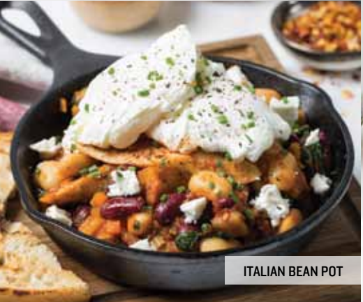
ITALIAN BEAN POT